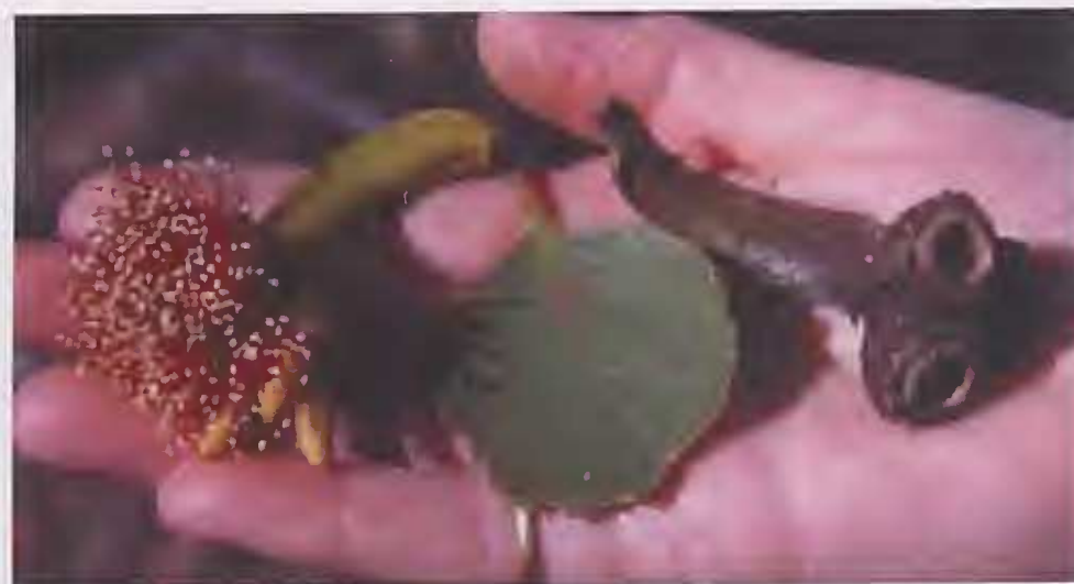
Figure 5. Buds, flowers and fruit of E. nutans November 2006 (Photo N. McQuoid).